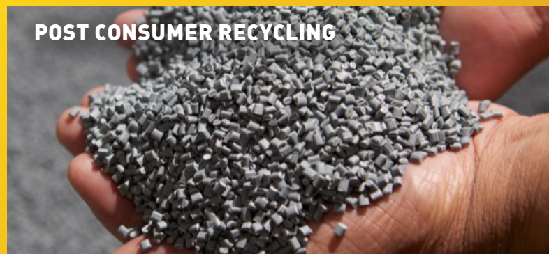
POST CONSUMER RECYCLING